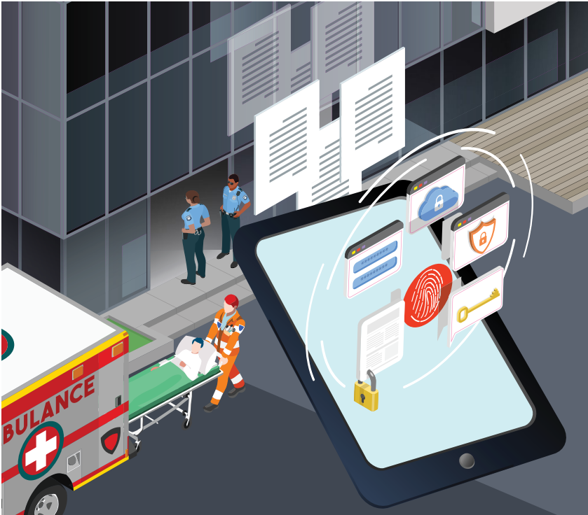
Secure Data Sharing, Data Access, and Identity Management