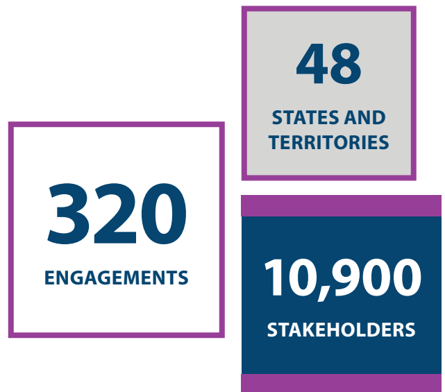
Public safety engagements that addressed Secure Information Exchange (October 1, 2019 – September 30, 2020)